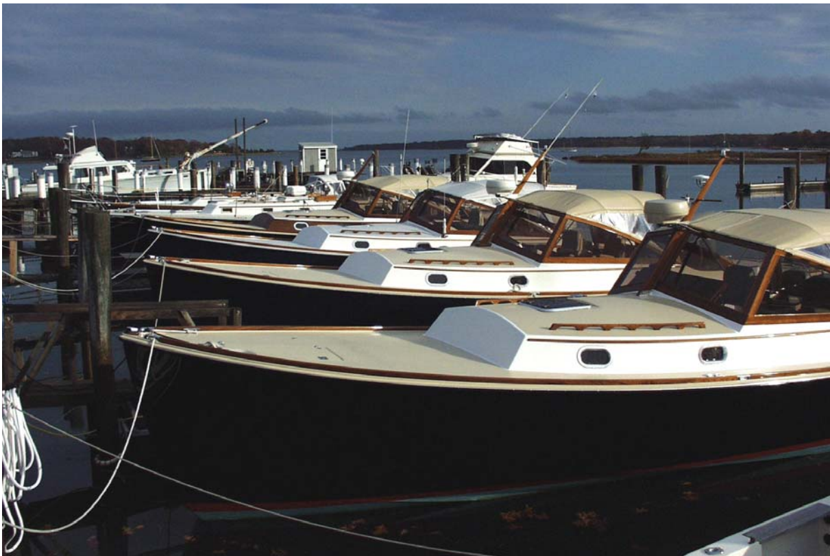
Four Shelter Island Runabouts at rest at Coecles Harbor Marine